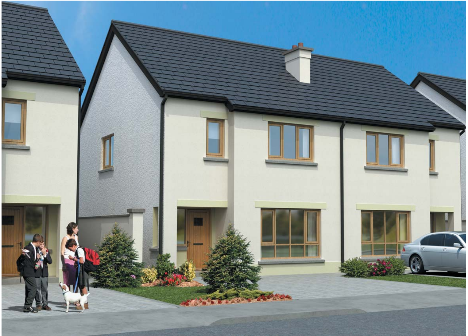
Type C1 (3 bed semi detached, 1307 sq ft / 121.40 sq mts)